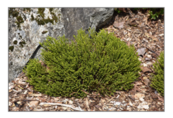
McKeanii Hebe

McKeanii Hebe is recommended for the following landscape applications;