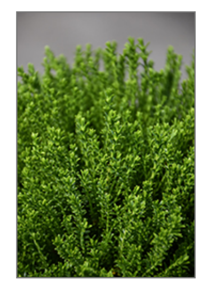
McKeanii Hebe foliage