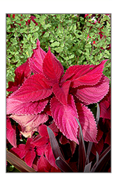
Hot Lava Coleus foliage

Hot Lava Coleus will grow to be about 18 inches tall at maturity, with a spread of 14 inches. When grown in masses or used as a bedding plant, individual plants should be spaced approximately 10 inches apart. Although it's not a true annual, this fast-growing plant can be expected to behave as an annual in our climate if left outdoors over the winter, usually needing replacement the following year. As such, gardeners should take into consideration that it will perform differently than it would in its native habitat.