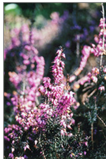
Furzey Heath flowers