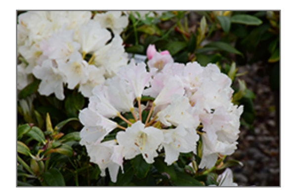
Yaku Princess Rhododendron flowers