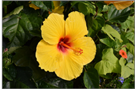
Sunny Wind Hibiscus flowers

This plant does best in full sun to partial shade. It requires an evenly moist well-drained soil for optimal growth, but will die in standing water. It is not particular as to soil type or pH. It is highly tolerant of urban pollution and will even thrive in inner city environments. Consider applying a thick mulch around the root zone in winter to protect it in exposed locations or colder microclimates. This is a selected variety of a species not originally from North America. It can be propagated by cuttings; however, as a cultivated variety, be aware that it may be subject to certain restrictions or prohibitions on propagation.