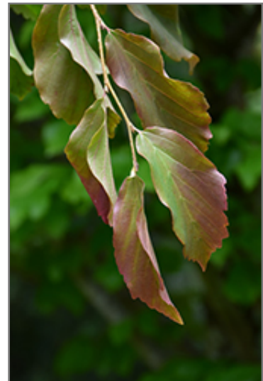
Ruby Vase Parrotia foliage