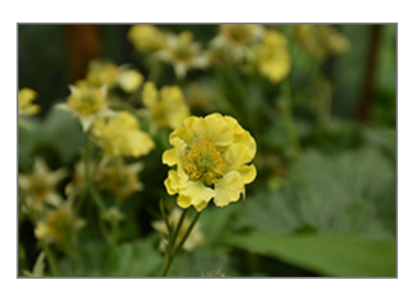
Cocktails Banana Daiquiri Avens flowers