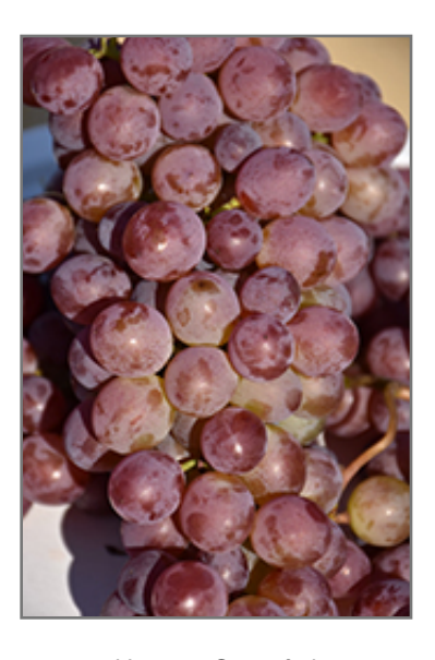
Vanessa Grape fruit

Aside from its primary use as an edible, Vanessa Grape is sutiable for the following landscape applications;