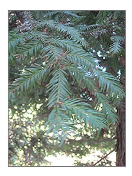
Aptos Blue Coast Redwood foliage

This tree does best in full sun to partial shade. It does best in average to evenly moist conditions, but will not tolerate standing water. It is not particular as to soil type, but has a definite preference for acidic soils. It is somewhat tolerant of urban pollution. This is a selection of a native North American species.