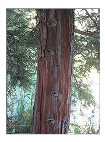
Aptos Blue Coast Redwood bark