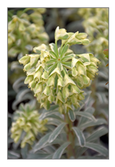
Glacier Blue Euphorbia flowers