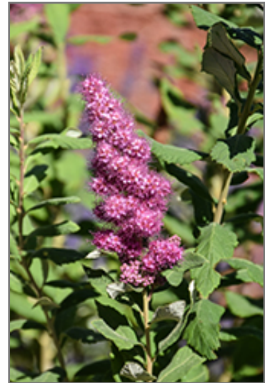
Western Spirea flowers