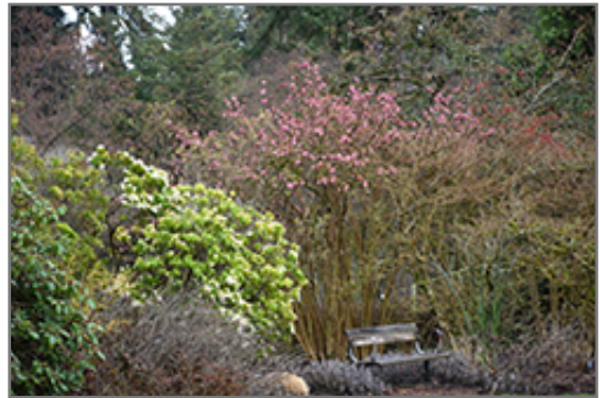
Dawn Viburnum in bloom