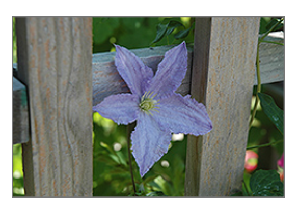
Blue Angel Clematis flowers