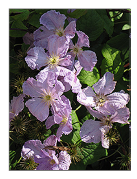
Blue Angel Clematis flowers