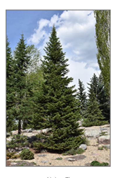
Alpine Fir