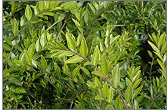
Royal Carpet Privet Honeysuckle foliage

An excellent choice for a shrubby groundcover or as a hedge; produces subtle white flowers that appear in early summer with purple berries that follow; takes pruning very well