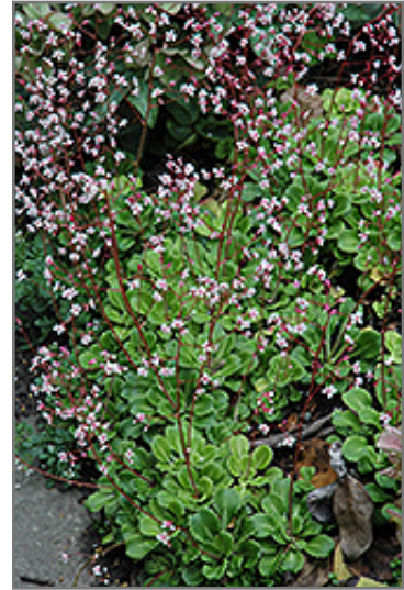
London Pride in bloom