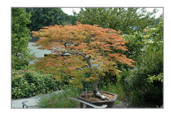
Baldsmith Japanese Maple

Baldsmith Japanese Maple will grow to be about 10 feet tall at maturity, with a spread of 15 feet. It has a low canopy with a typical clearance of 1 foot from the ground, and is suitable for planting under power lines. It grows at a medium rate, and under ideal conditions can be expected to live for 80 years or more.