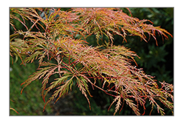
Baldsmith Japanese Maple foliage