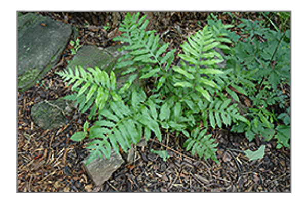
Netted Chain Fern