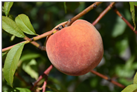
Redhaven Peach fruit

Redhaven Peach is covered in stunning clusters of fragrant pink flowers along the branches in early spring, which emerge from distinctive rose flower buds before the leaves. It has dark green deciduous foliage. The narrow leaves turn yellow in fall. The fruits are showy yellow drupes with a red blush, which are carried in abundance in mid summer. The fruit can be messy if allowed to drop on the lawn or walkways, and may require occasional clean-up.