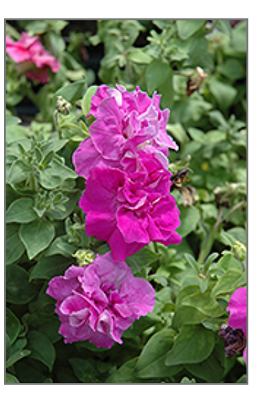
Double Madness Lavender Petunia flowers