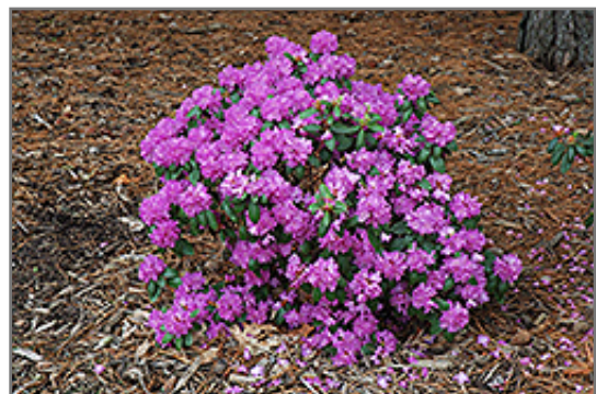
Compact P.J.M. Rhododendron in bloom