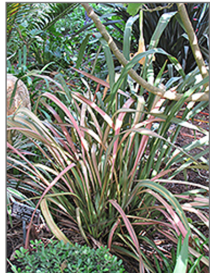
Jester New Zealand Flax