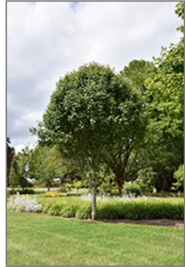
Jack Ornamental Pear

This tree should only be grown in full sunlight. It prefers to grow in average to moist conditions, and shouldn't be allowed to dry out. It is not particular as to soil type or pH. It is highly tolerant of urban pollution and will even thrive in inner city environments. This is a selected variety of a species not originally from North America.