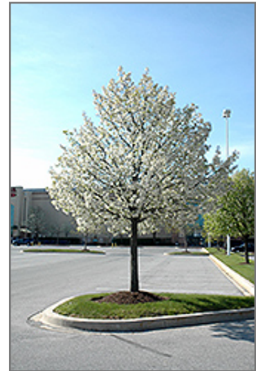
Jack Ornamental Pear in bloom