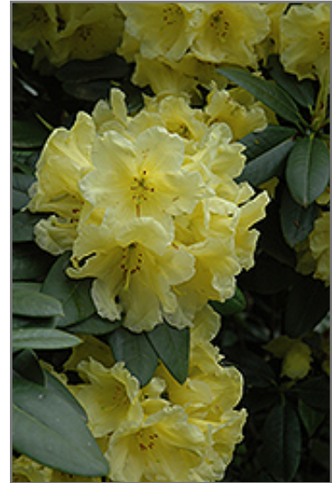
Hotei Rhododendron flowers

Hotei Rhododendron will grow to be about 3 feet tall at maturity, with a spread of 4 feet. It tends to be a little leggy, with a typical clearance of 1 foot from the ground. It grows at a slow rate, and under ideal conditions can be expected to live for 40 years or more.