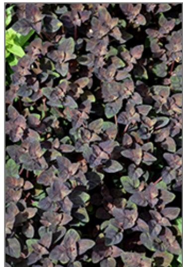
Persian Chocolate Loosestrife foliage