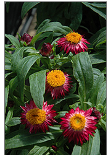
Mohave Dark Red Strawflower flowers