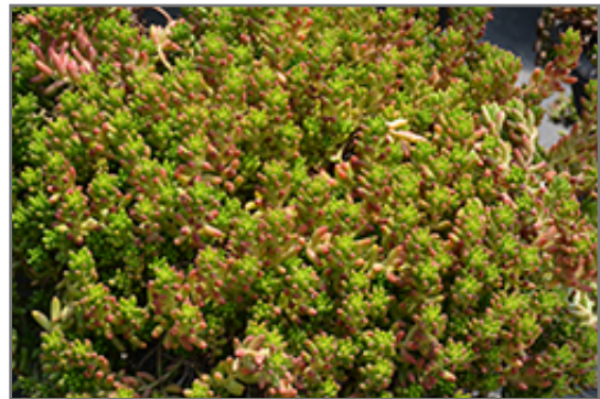
Jelly Bean Plant