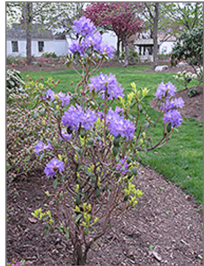
Blue Baron Rhododendron in bloom

This shrub does best in full sun to partial shade. You may want to keep it away from hot, dry locations that receive direct afternoon sun or which get reflected sunlight, such as against the south side of a white wall. It requires an evenly moist well-drained soil for optimal growth, but will die in standing water. It is very fussy about its soil conditions and must have rich, acidic soils to ensure success, and is subject to chlorosis (yellowing) of the foliage in alkaline soils. It is somewhat tolerant of urban pollution, and will benefit from being planted in a relatively sheltered location. Consider applying a thick mulch around the root zone in winter to protect it in exposed locations or colder microclimates. This particular variety is an interspecific hybrid.