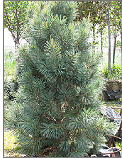
Vanderwolf's Pyramid Pine