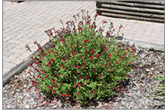
Radio Red Autumn Sage in bloom