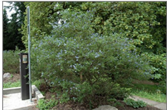
Italian Skies California Lilac in bloom