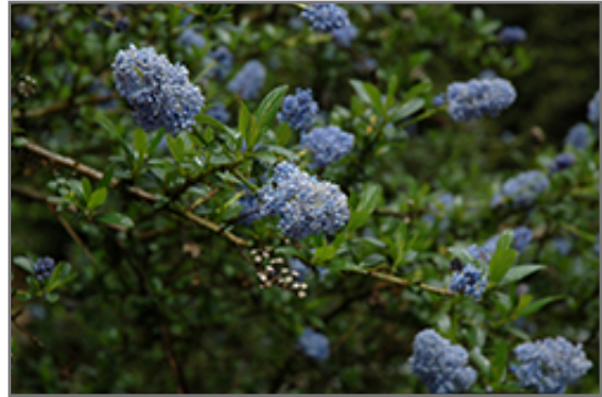
Italian Skies California Lilac flowers