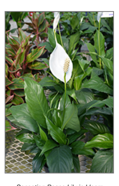
Sensation Peace Lily in bloom

When grown indoors, Sensation Peace Lily can be expected to grow to be about 5 feet tall at maturity, with a spread of 3 feet. It grows at a medium rate, and under ideal conditions can be expected to live for approximately 10 years. This houseplant performs well in both bright or indirect sunlight and strong artificial light, and can therefore be situated in almost any well-lit room or location. It prefers to grow in average to moist soil. The surface of the soil shouldn't be allowed to dry out completely, and so you should expect to water this plant once and possibly even twice each week. Be aware that your particular watering schedule may vary depending on its location in the room, the pot size, plant size and other conditions; if in doubt, ask one of our experts in the store for advice. It is particular about its soil conditions, with a strong preference for rich, acidic soil. Contact the store for specific recommendations on pre-mixed potting soil for this plant. Be warned that parts of this plant are known to be toxic to humans and animals, so special care should be exercised if growing it around children and pets.