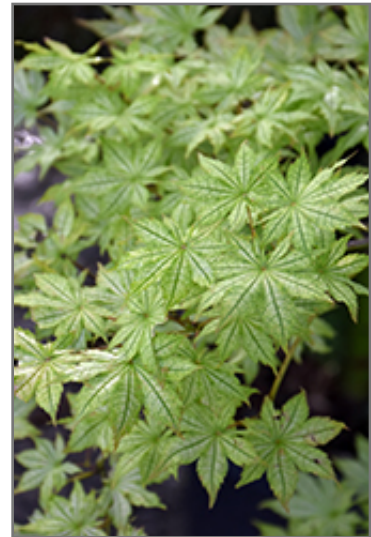
Shigitatsu Sawa Japanese Maple foliage