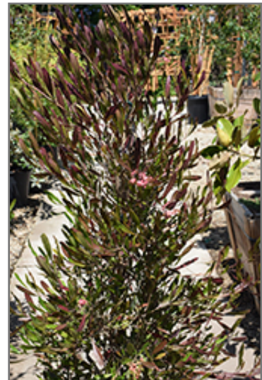
Purple Hop Bush