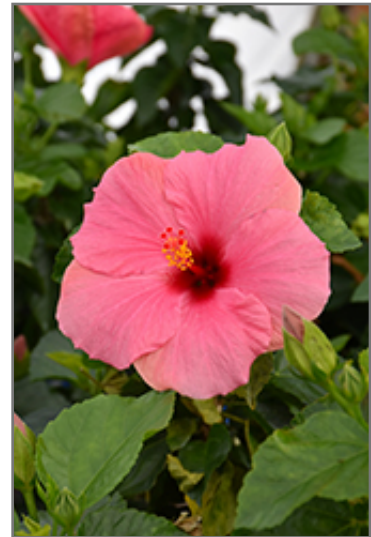
Cayman Wind Hibiscus flowers

Cayman Wind Hibiscus is a fine choice for the garden, but it is also a good selection for planting in outdoor pots and containers. Its large size and upright habit of growth lend it for use as a solitary accent, or in a composition surrounded by smaller plants around the base and those that spill over the edges. It is even sizeable enough that it can be grown alone in a suitable container. Note that when growing plants in outdoor containers and baskets, they may require more frequent waterings than they would in the yard or garden.