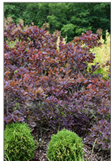
Velveteeny Purple Smokebush