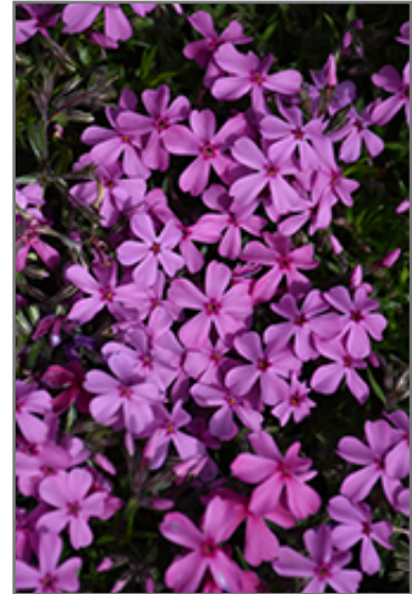
Spring Dark Pink Moss Phlox flowers

Spring Dark Pink Moss Phlox is recommended for the following landscape applications;