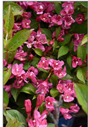
Date Night Strobe Weigela flowers