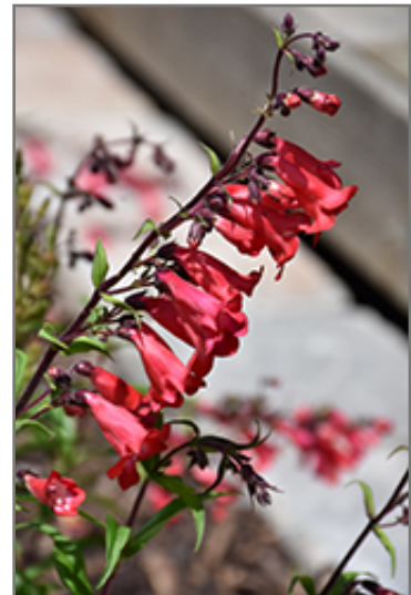
Cherry Sparks Beard Tongue flowers