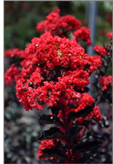
Black Diamond Best Red Crapemyrtle flowers

Black Diamond Best Red Crapemyrtle is recommended for the following landscape applications;