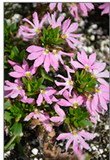
Surdiva Classic Pink Fan Flower flowers