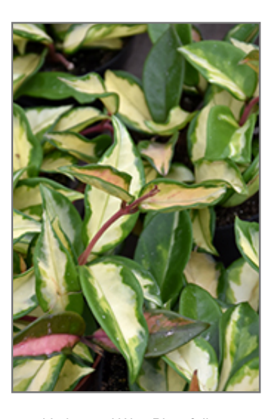
Variegated Wax Plant foliage

When grown indoors, Variegated Wax Plant can be expected to grow to be about 12 inches tall at maturity, with a spread of 5 feet. It grows at a medium rate, and under ideal conditions can be expected to live for approximately 10 years. This houseplant should be situated in a location that that gets indirect sunlight at most, although it will usually require a more brightly-lit environment than what artificial indoor lighting alone can provide. It is very adaptable to both dry and moist soil, but will not tolerate any standing water. The surface of the soil shouldn't be allowed to dry out completely, and so you should expect to water this plant once and possibly even twice each week. Be aware that your particular watering schedule may vary depending on its location in the room, the pot size, plant size and other conditions; if in doubt, ask one of our experts in the store for advice. It is not particular as to soil pH, but grows best in rich soil. Contact the store for specific recommendations on pre-mixed potting soil for this plant.