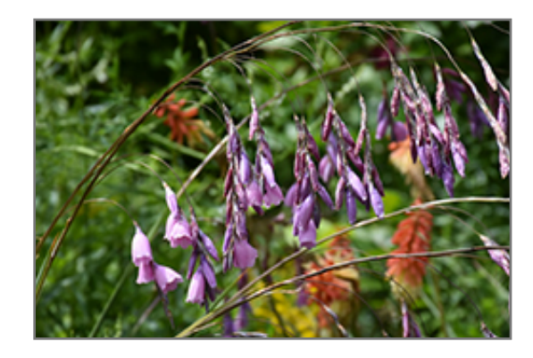
Angel's Fishing Rod flowers

This plant will require occasional maintenance and upkeep, and is best cleaned up in early spring before it resumes active growth for the season. It is a good choice for attracting hummingbirds to your yard, but is not particularly attractive to deer who tend to leave it alone in favor of tastier treats. It has no significant negative characteristics.