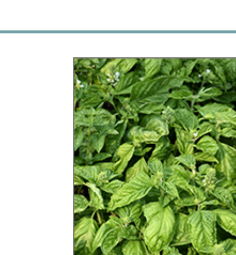
Mammoth Basil foliage

Mammoth Basil will grow to be about 24 inches tall at maturity, with a spread of 18 inches. When grown in masses or used as a bedding plant, individual plants should be spaced approximately 10 inches apart. This fast-growing annual will normally live for one full growing season, needing replacement the following year.