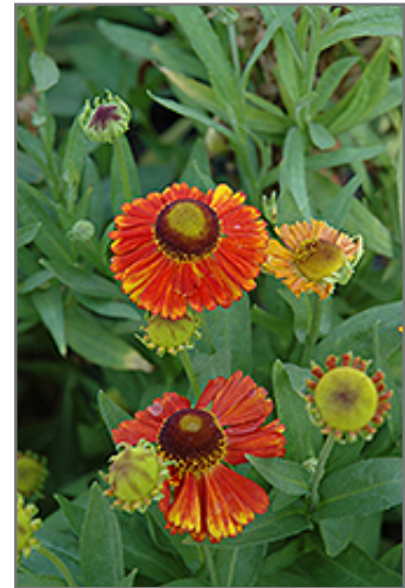
Sahin's Early Flowerer Sneezeweed flowers

This plant will require occasional maintenance and upkeep, and should be cut back in late fall in preparation for winter. It is a good choice for attracting butterflies to your yard, but is not particularly attractive to deer who tend to leave it alone in favor of tastier treats. Gardeners should be aware of the following characteristic(s) that may warrant special consideration;