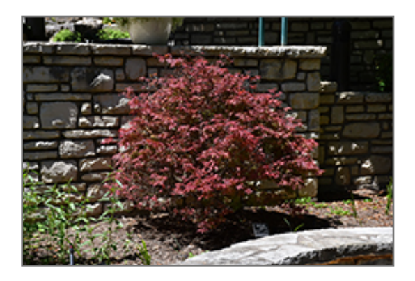
Shaina Japanese Maple

Shaina Japanese Maple is recommended for the following landscape applications;