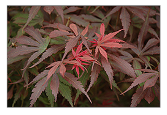
Shaina Japanese Maple foliage