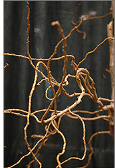
Horstmann's Recurved Larch bark