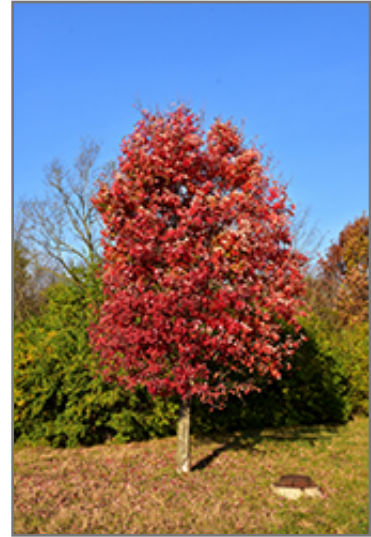
Autumn Flame Red Maple in fall