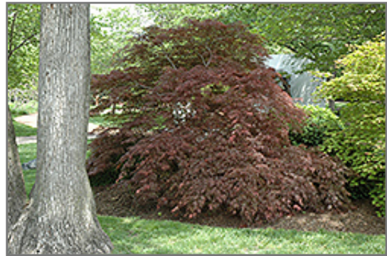
Garnet Cutleaf Japanese Maple

Garnet Cutleaf Japanese Maple will grow to be about 10 feet tall at maturity, with a spread of 8 feet. It has a low canopy with a typical clearance of 1 foot from the ground, and is suitable for planting under power lines. It grows at a fast rate, and under ideal conditions can be expected to live for 60 years or more.