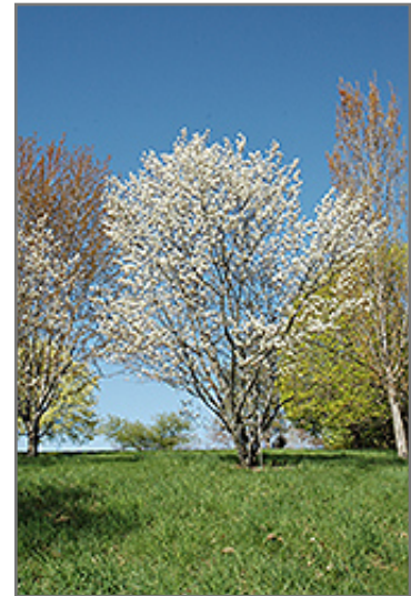
Princess Diana Serviceberry in bloom